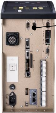
ID data input port (RS232C)

ID data can be input to our controller through a RS232C serial device such as a barcode reader.