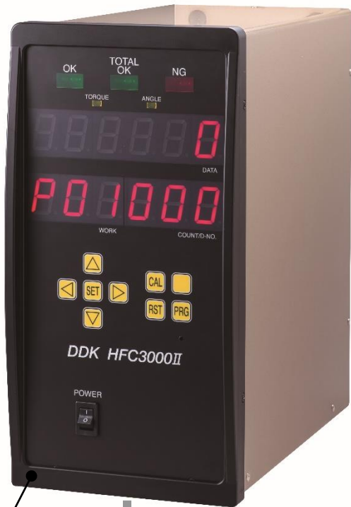
HFC3000 II Controller